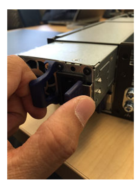
FIGURE 3 Removing the PSU

Remove the replacement PSU from its antistatic packaging, and verify that there is no visible damage to it.