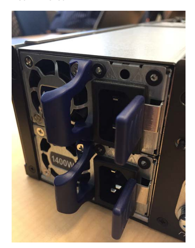
FIGURE 1 AC PSU

1. Locate the PSU that must be replaced.